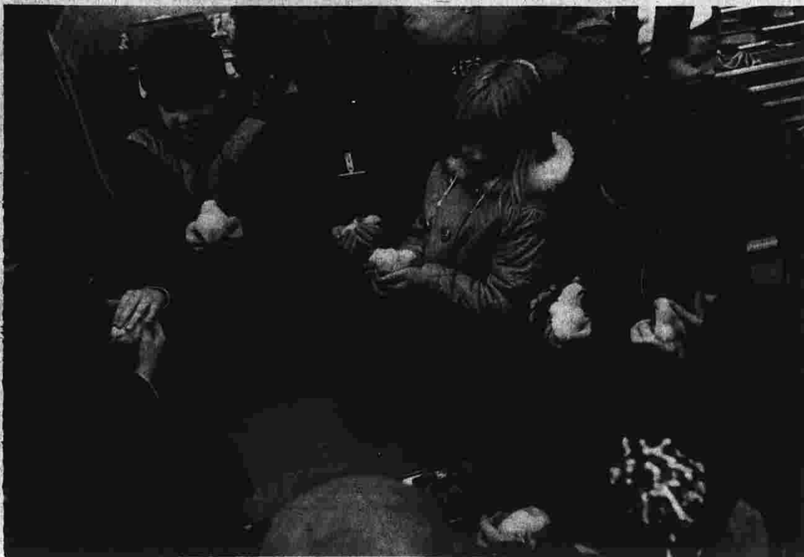
Holding a Life in Their Hands

The freeze was ordered because the commission decided firmer guidelines are needed for the regulatory bodies.